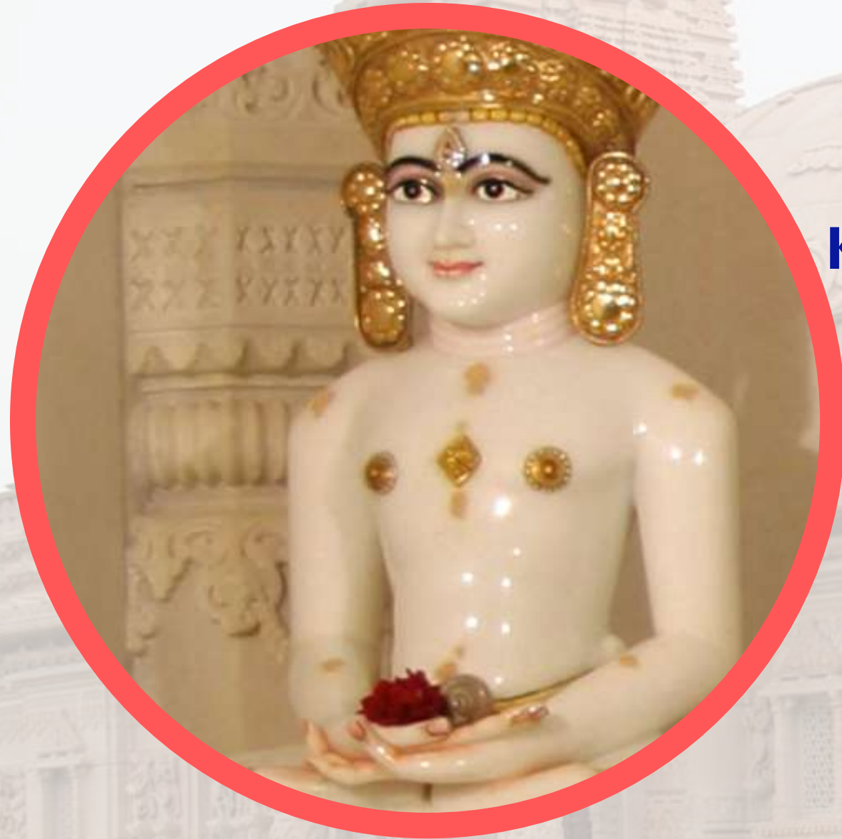
Adinath Bhagwan Pratima Shikharbandhi Jinalaya Oshwal Centre

He was the first person to renounce his worldly life to become a Jain ascetic. Adinath attained Nirvana (moksha) at Mount Ashtapad together with 10,000 additional Jain ascetics.