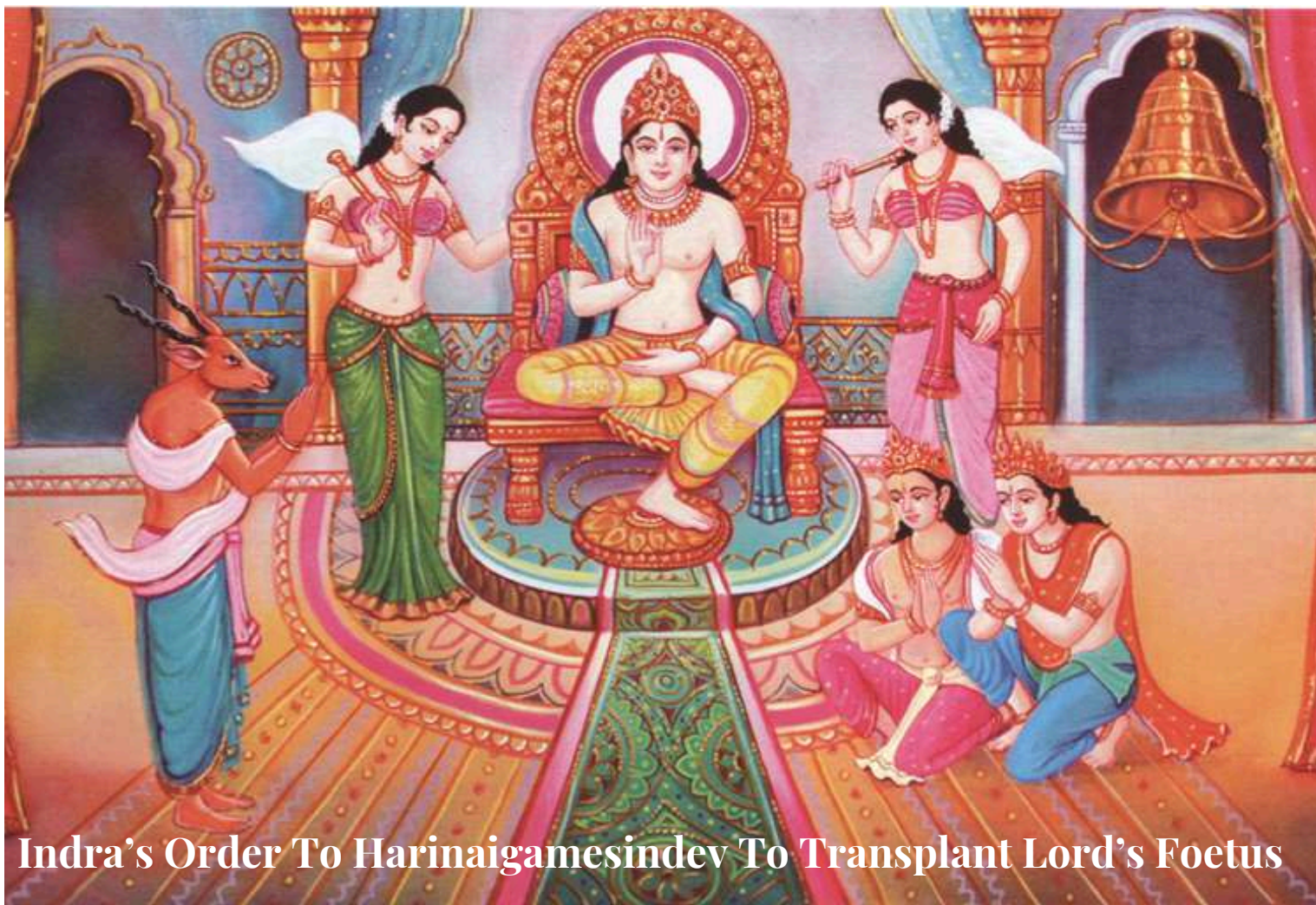
Indra's Order To Harinaigamesindev To Transplant Lord's Foetus

Mahavir's pride at being born into a high caste family as in his third birth, invariably resulted in being born into a much lower caste family. This event illustrates the theory of karma - of action and reaction. Lesson for us is to understand not to be arrogant or egoistic about our achievements but to be humble and take them as a blessing.