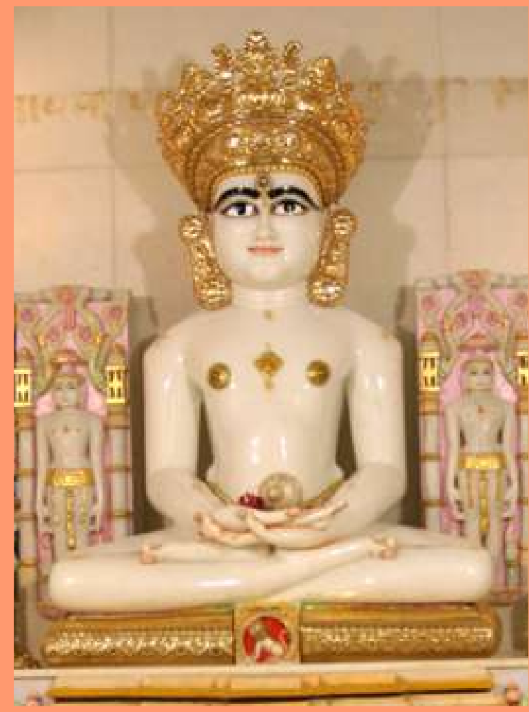
Mahavirswami Bhagwan Pratima