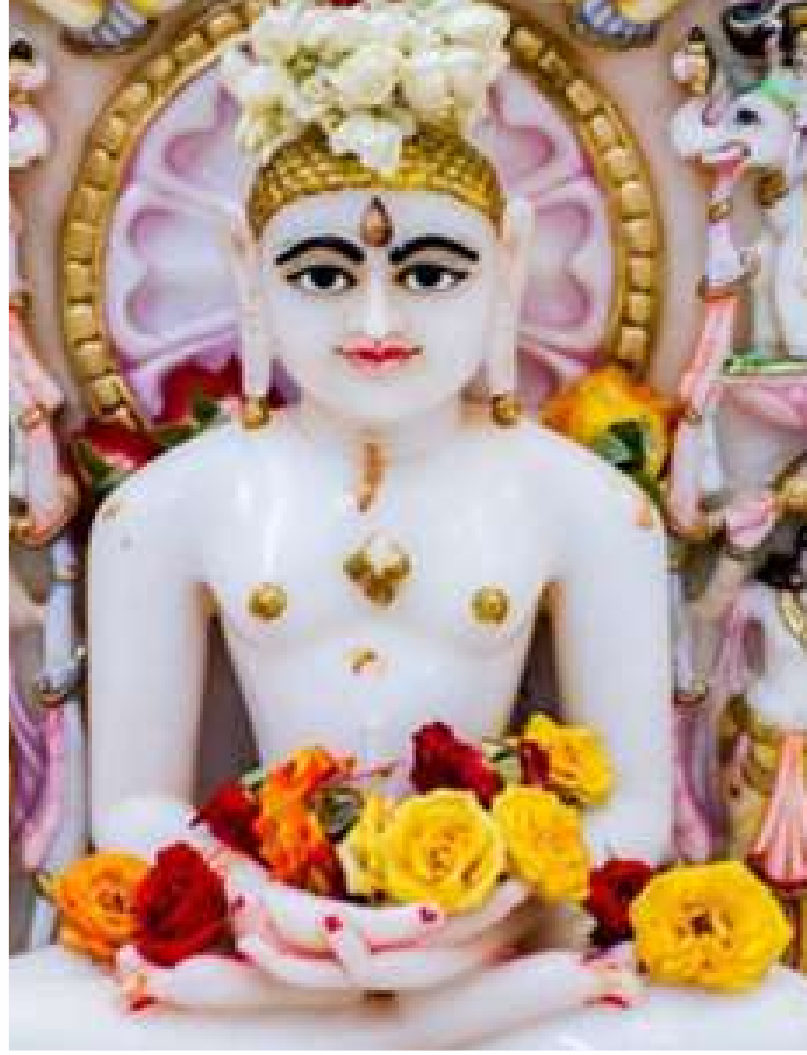
Suvidhinath Jinalaya- Melbourne