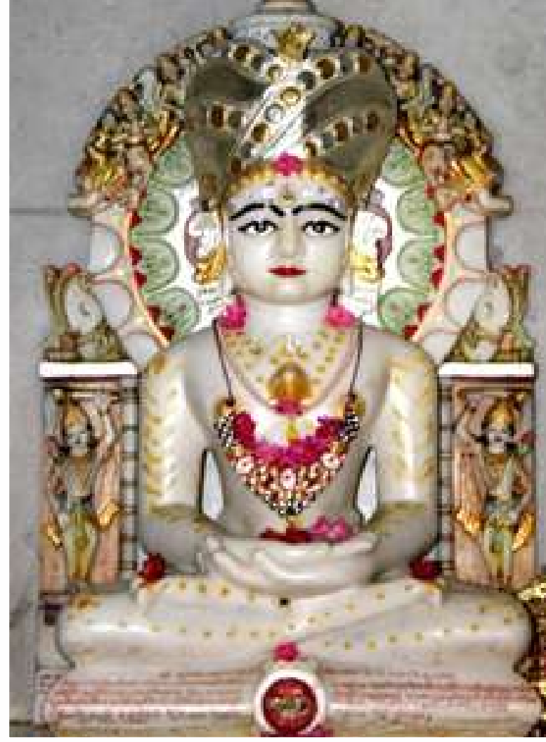
Kakandi Jain Tirth - Mulnayak Suvidhinath Bhagwan