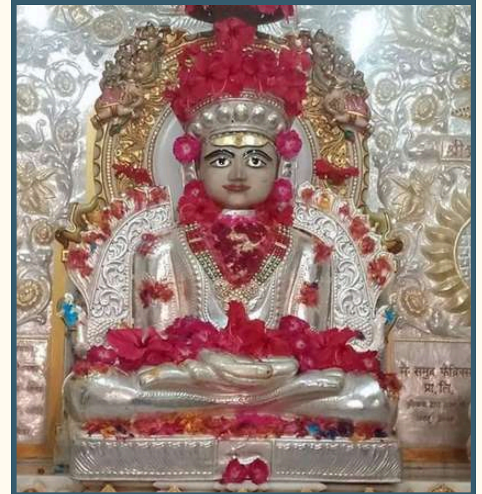
Shantinath Bhagwan | Hastinapur, India